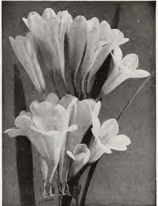
Freesia, S. & W. Co.'s Improved Purity

Fischer's Splendens. This comparatively new Freesia, introduced by the originator of Purity, stands in a distinct class. The flowers are equal in size to Purity and the plant just as vigorous. The stems are long and stiff, bearing as many flowers as Purity, of a beautiful deep lavender color which seems to be well retained throughout the life of the flower. $1 per doz., $8 per 100, $75 per 1,000.